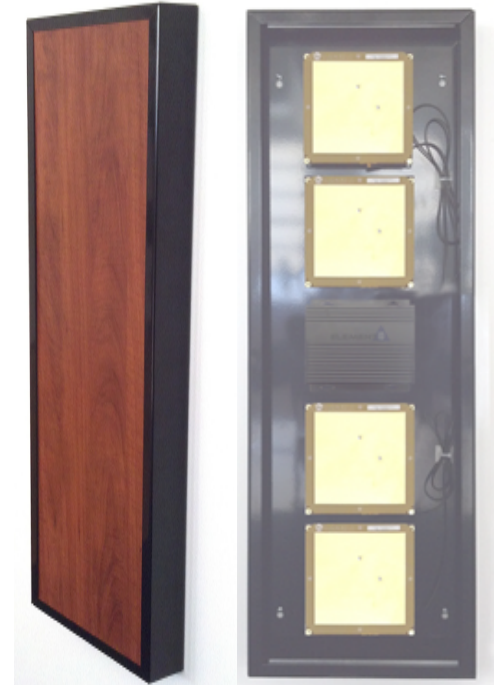
Decorative RFID Smart Portal (SP-DDP-1)